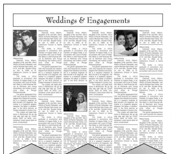
Weddings & Engagements Example